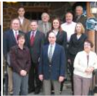
Local Municipal Managers