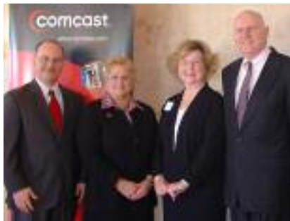
School District Superintendents