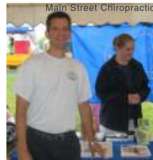
Main Street Chiropractic

Members Exhibit at Community Days . . . Limerick, Lower Providence and Trappe