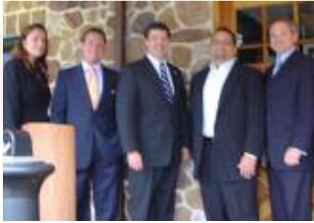
U.S. Congressman Jim Gerlach