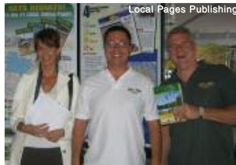
Local Pages Publishing