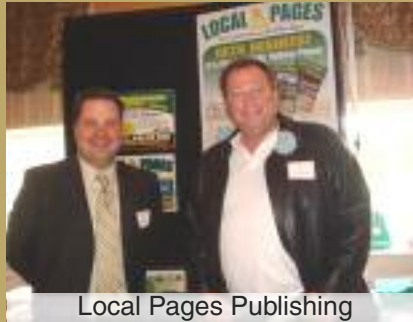
Local Pages Publishing