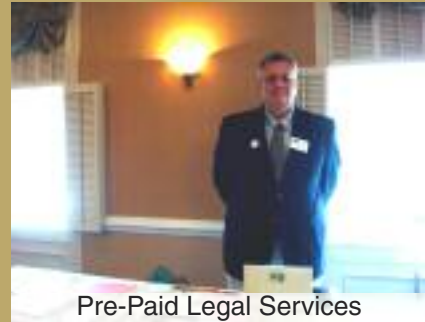
Pre-Paid Legal Services