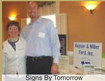
Signs By Tomorrow