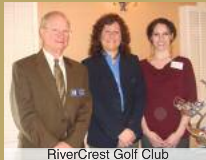
RiverCrest Golf Club