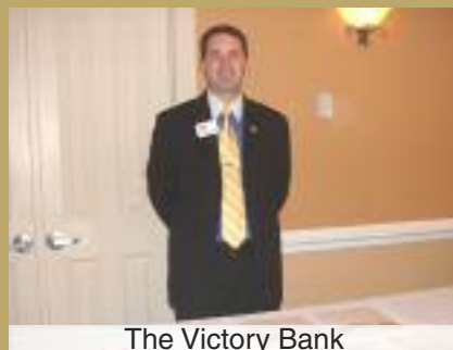
The Victory Bank