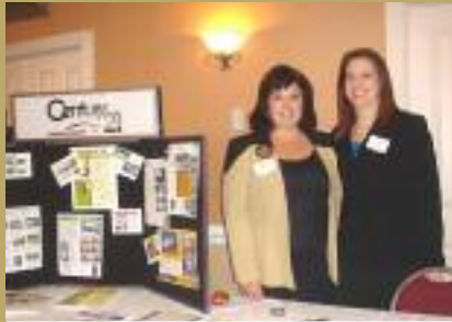
Century 21 Alliance - Sitsis