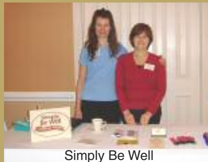
Simply Be Well