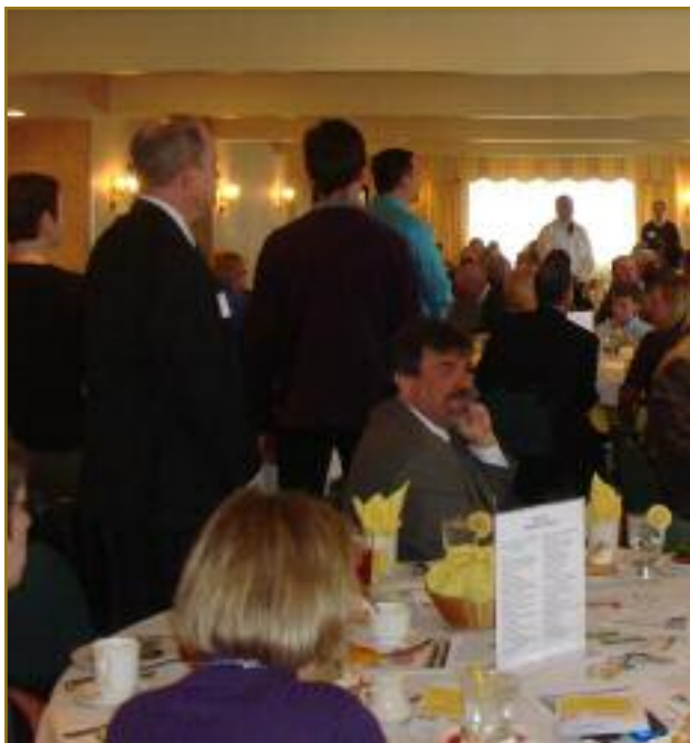
New Members were introduced at the Annual Meeting. Over 100 members attended and networked before and after the formal agenda.