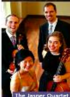
The Jasper Quartet October 15, 2011

In the Gallery at CMS: "Inspired by Light" by Molly Light