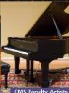
CMS Faculty Artists November 19, 2011