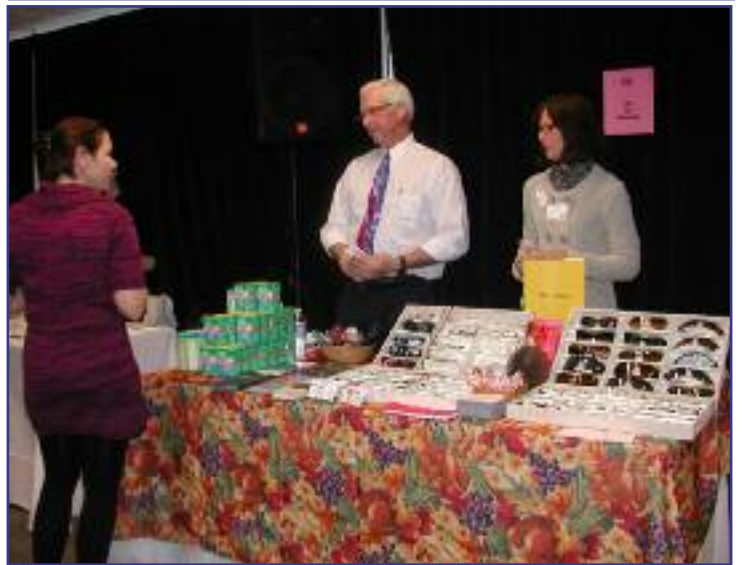
Set-up and take down went smoothly thanks to the cooperation of the 92 businesses at the Pfizer Business Expo -- many thanks!