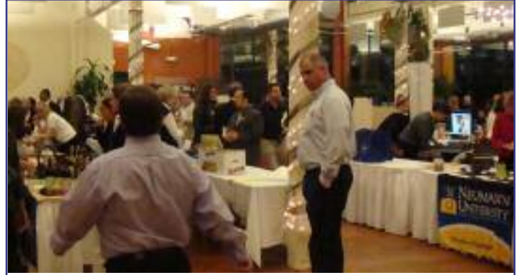
Fall Mega Mixer & Biz Expo with Chamber Alliance of Chester County at Franklin Commons on 11/3/10.