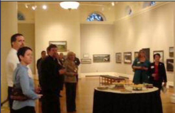
Approximately 50 PV Chamber members networked and viewed the renovated museum and incredible exhibits and collections at the Mixer on 10/14/10.

Hours: Tuesday - Friday, 10 a.m. - 4 p.m. Saturday and Sunday - noon to 4:30 p.m. Closed Monday and college holidays.